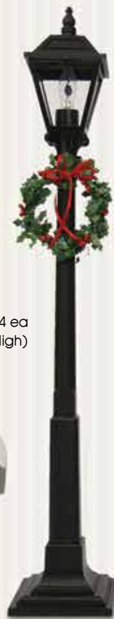
Lamppost - $44 ea (Electric; 22" High)