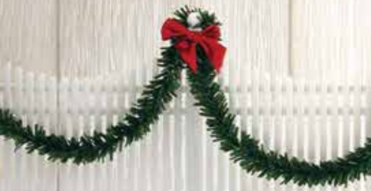
Decorated Picket Fence - $36 ea (20" W x 7" H; plastic)