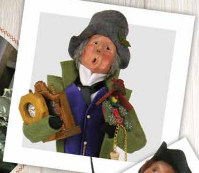
Clockmaker - $75 ea