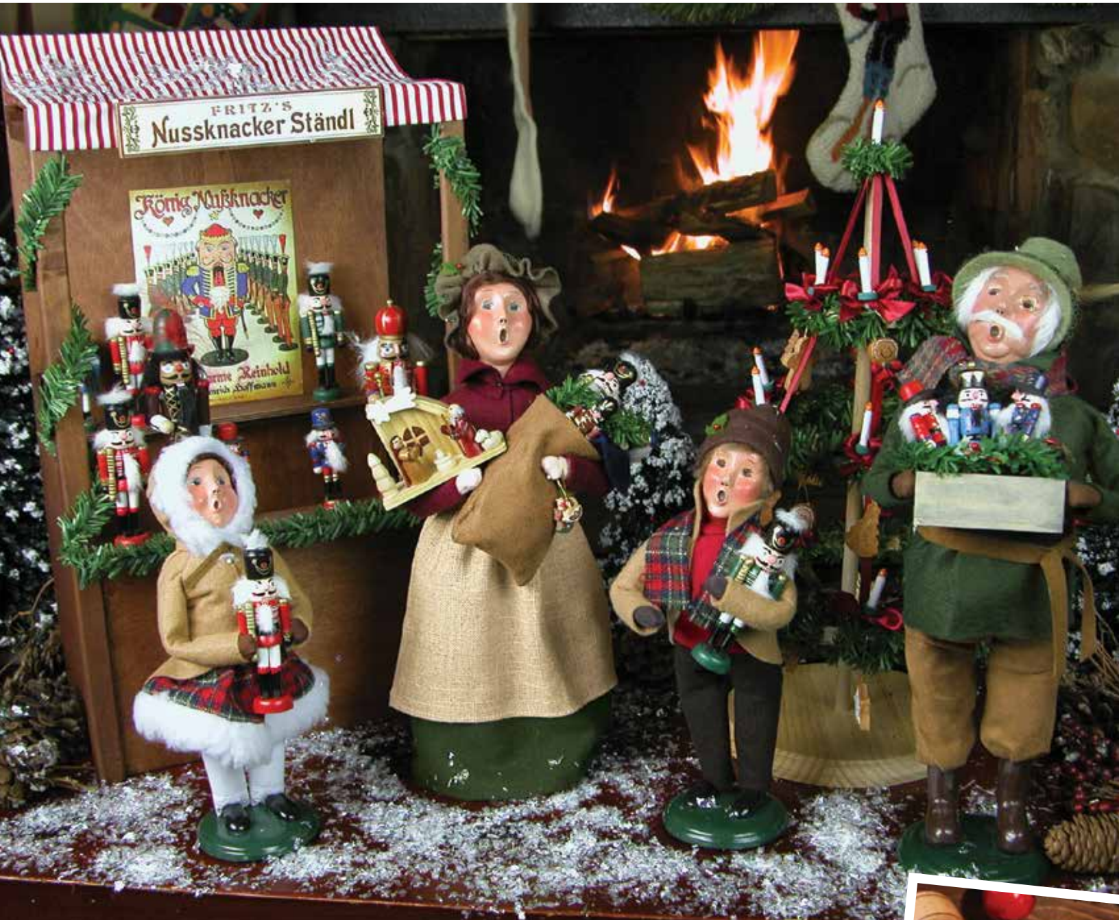
Girl & Boy Holding Nutcracker - $69 ea; Nutcracker Market Stall (11"W x 6"D x 18"H) - $80 ea; Nutcracker Woman 2015 & Nutcracker Vendor 2015 - $72 ea;

A bowl of unshelled nuts is still a must at Christmas!