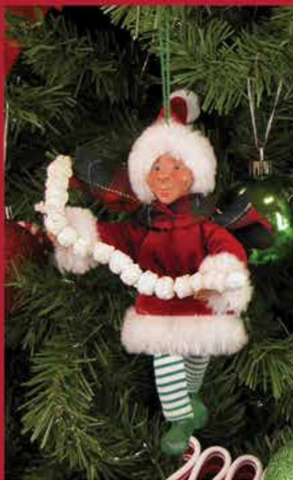
"Pops" Kindle Tree Ornament - $25 ea