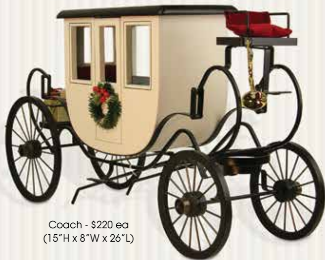
Coach - $220 ea (15"H x 8"W x 26"L)