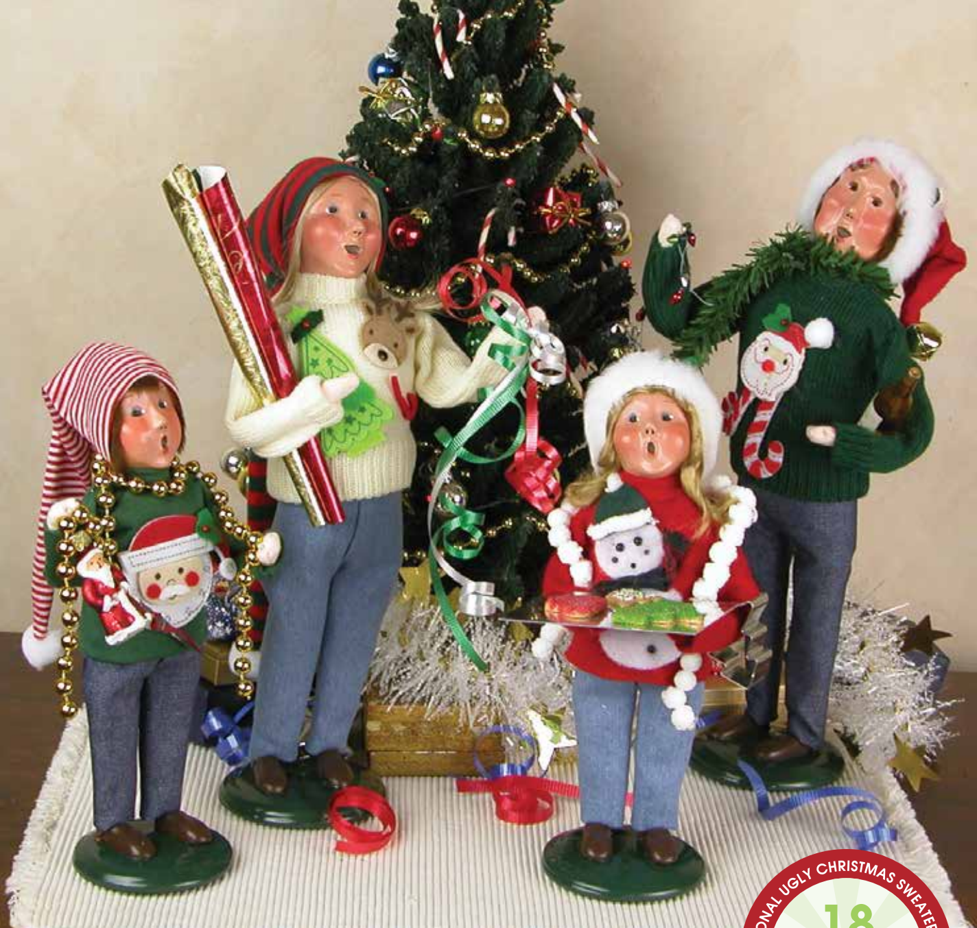
Ugly Christmas Sweater Family; sold separately - $72 ea; Decorated Tree w/ Lights - $48 ea

National Ugly Christmas Sweater Day is about proudly sporting your favorite ugly Christmas sweater for the entire day.