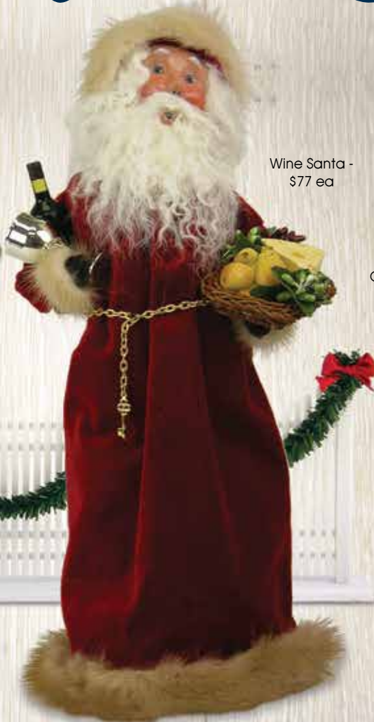
Wine Santa - $77 ea