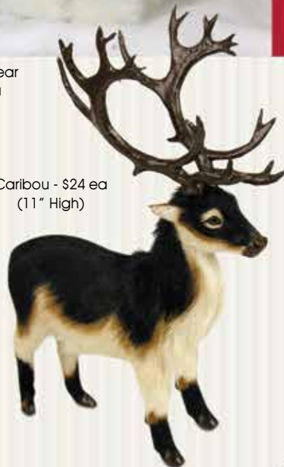
Caribou - $24 ea (11" High)