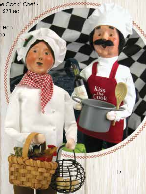
Chef with Hen - $73 ea