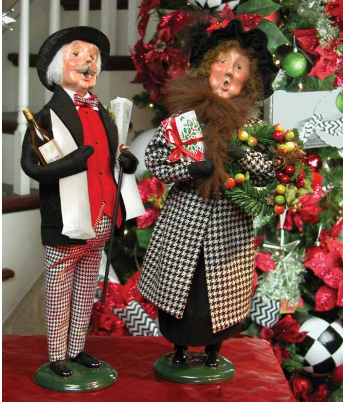
Auntie Esther & Auntie Esther's New Boyfriend - $74 ea

The magic of Christmas never ends, and its greatest gifts are family and friends.