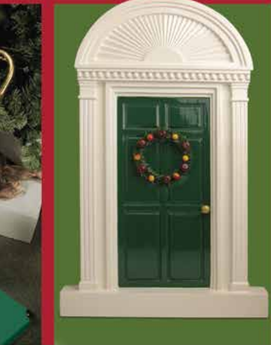
Door - $60 ea (19.5" H x 13" W x 3.5" D)