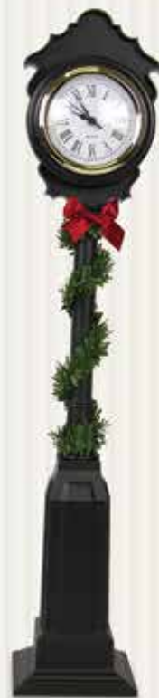
Street Clock - $48 ea Requires one "N" battery - not included (19" High)