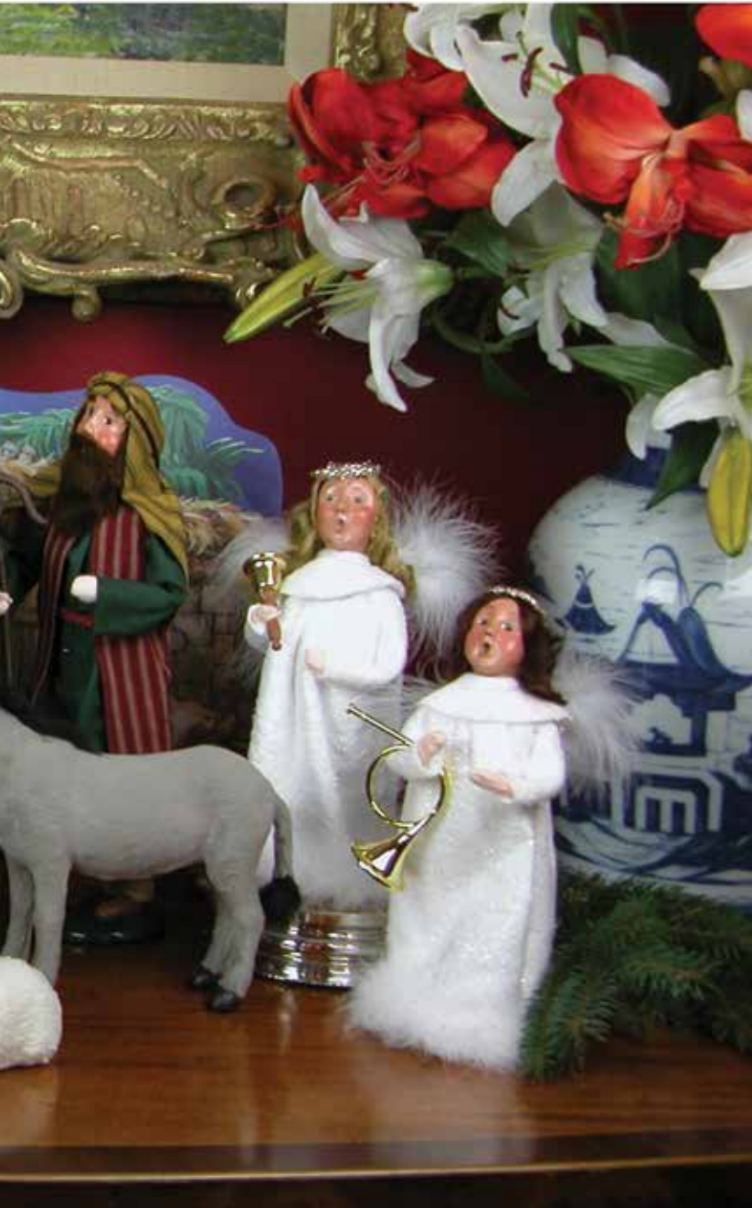
Angel Girl (Bell) - $71 ea; Holy Family - $160 ea; Camel - $65 ea;

As the messengers of God, chief among them Gabriel, the angels brought news of the birth of Jesus to the people, just as they had foretold his birth to Mary and her husband-to-be, Joseph, many months before. Ever since, the figure of the angel has been an integral part of the Christmas story and has appeared in nativity scenes and plays around the world.