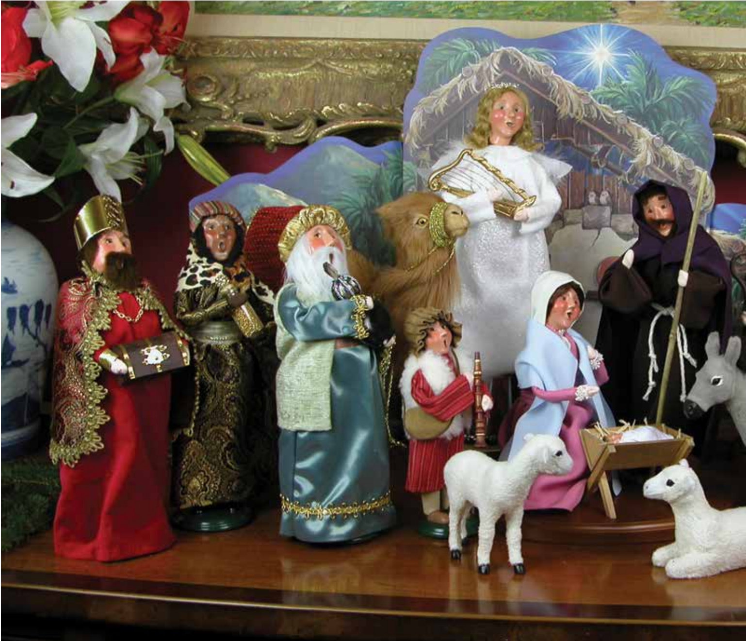
Red Wise Man, Golden Wise Man, Blue Wise Man - $75 ea; Shepherd Boy, Angel Woman (Harp), Shepherd Man, Angel Girl (Horn) - $71 ea Lambs (set of 2) - $40 set; Donkey - $25 ea; Baby Jesus in Manger (3"H x 3.25"W x 4"D) - $25 ea (can be purchased individually)

Love all lovely, Love Divine; Love was born at Christmas;