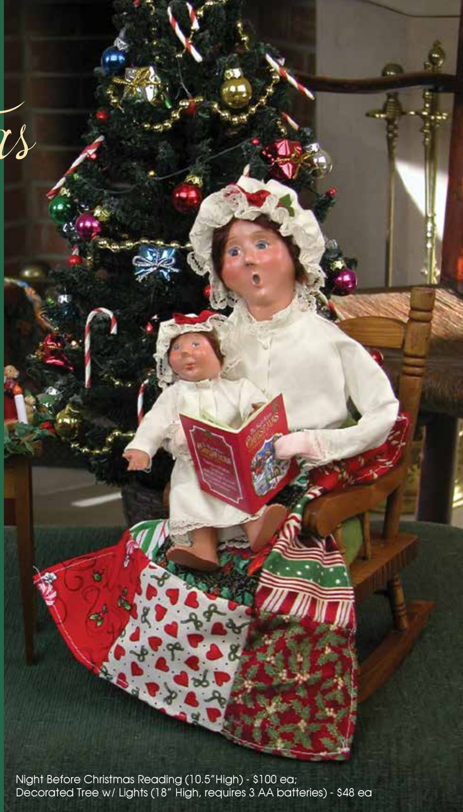
Night Before Christmas Reading (10.5" High) - $100 ea; Decorated Tree w/ Lights (18" High, requires 3 AA batteries) - $48 ea

I remember humming along to the familiar, cheerful Christmas music coming from the family room downstairs. "It's time to read The Night Before Christmas ," my father would pronounce. He would get out his reading glasses, and we'd all squeeze snugly into his favorite chair before he'd begin. "'Twas the night before Christmas and all through the house not a creature was stirring, not even a mouse." Silence. Just then, mom would sneak up and scare us by tickling our toes as if a mouse had just run between them. We'd jump, laugh and giggle as my father would continue reading his favorite Christmas poem seemingly unphased by all our hijinks. Over the years, we would find ourselves reading along with him. And at the close of the book, we knew it was time for bed and that Santa Claus would be coming soon.