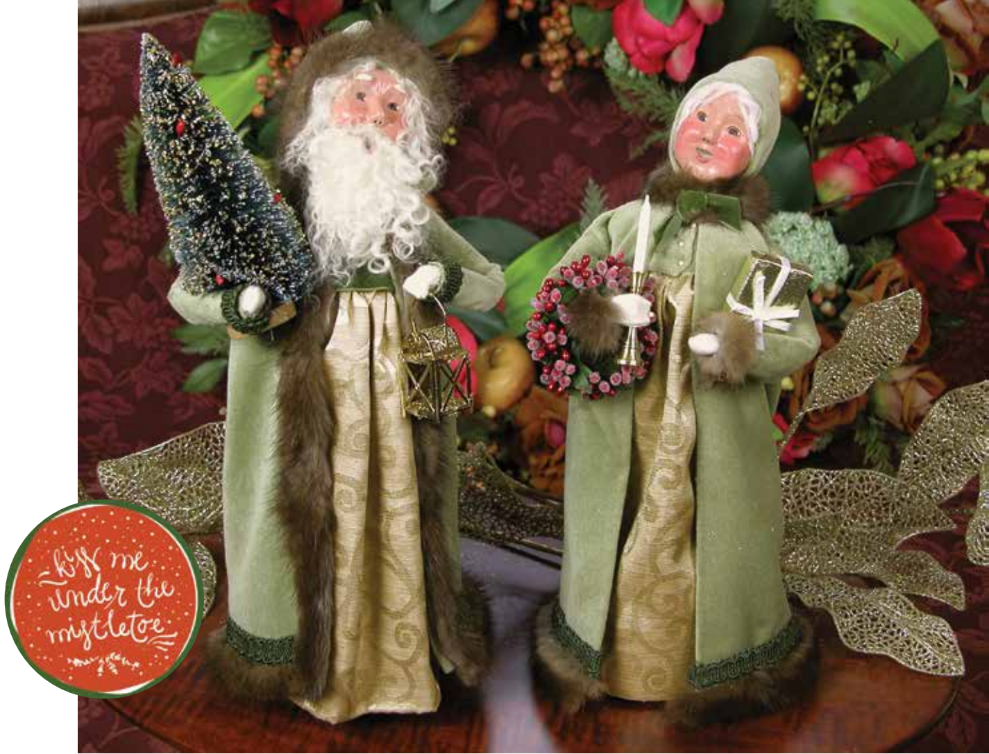
Mistletoe & Mink Santa and Mrs. Claus - $80 ea