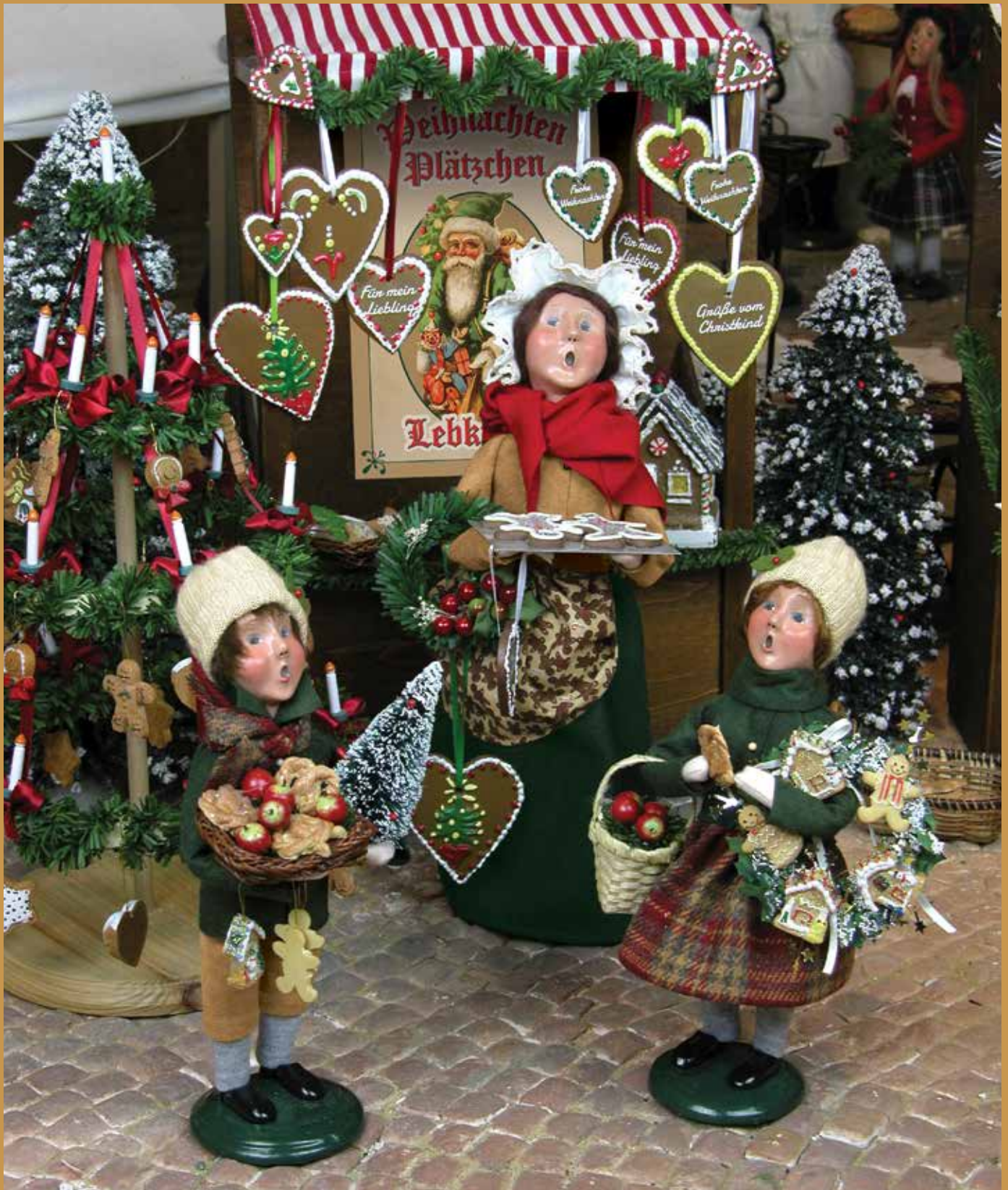
Woman Selling Gingerbread - $73 ea; Boy & Girl with Gingerbread - $70 ea; Gingerbread Market Stall - $85 ea