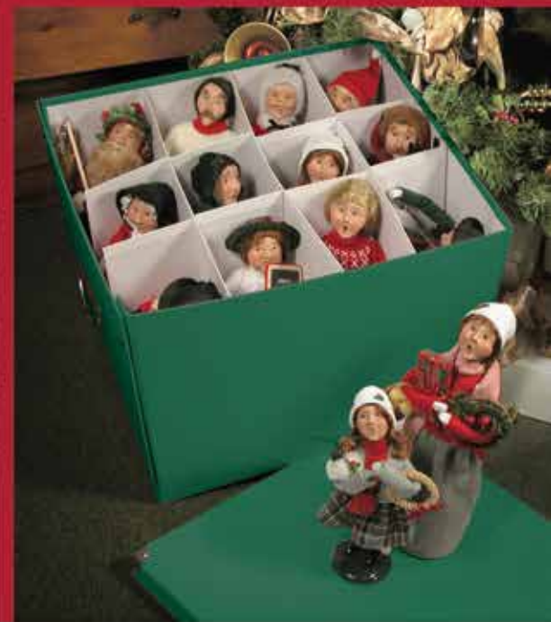
Caroler Condo Storage Box - $40 ea (17.5"L x 15.5"W x 14"H)