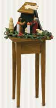
Nativity Table - $24 ea (8" High)