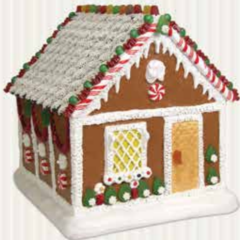
Kindle Cottage Resin Gingerbread House - $95 ea (11"W x 12"D x 13"H)