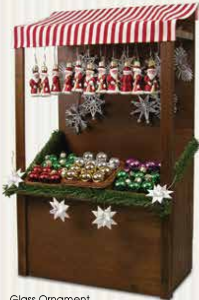
Glass Ornament Market Stall - $80 ea (11"W x 6"D x 18"H)