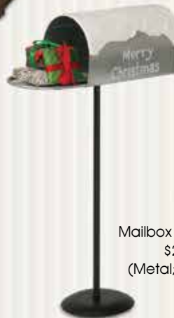
Mailbox with Stand - $20 ea (Metal; 7.5" High)