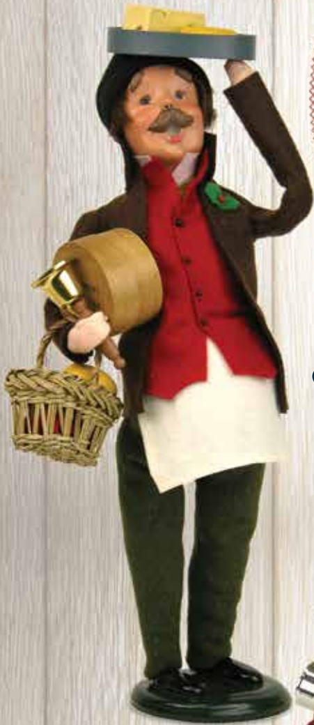
Cheese Monger - $73 ea