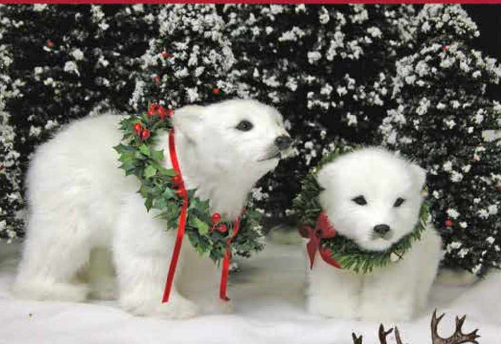
Polar Bear Cub - $20 ea (5.5"H x 8"L)