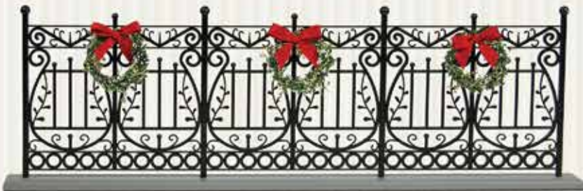
Wrought Iron Fence - $36 ea (Plastic; 21.5"W x 6.5"H)