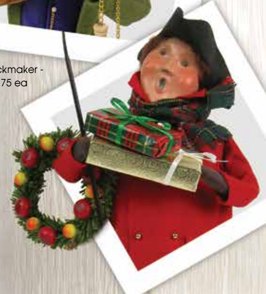
Coachman - $73 ea