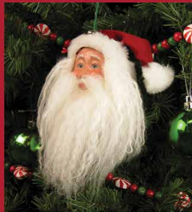
Santa Caroler Ornament (8"H) - $30 ea