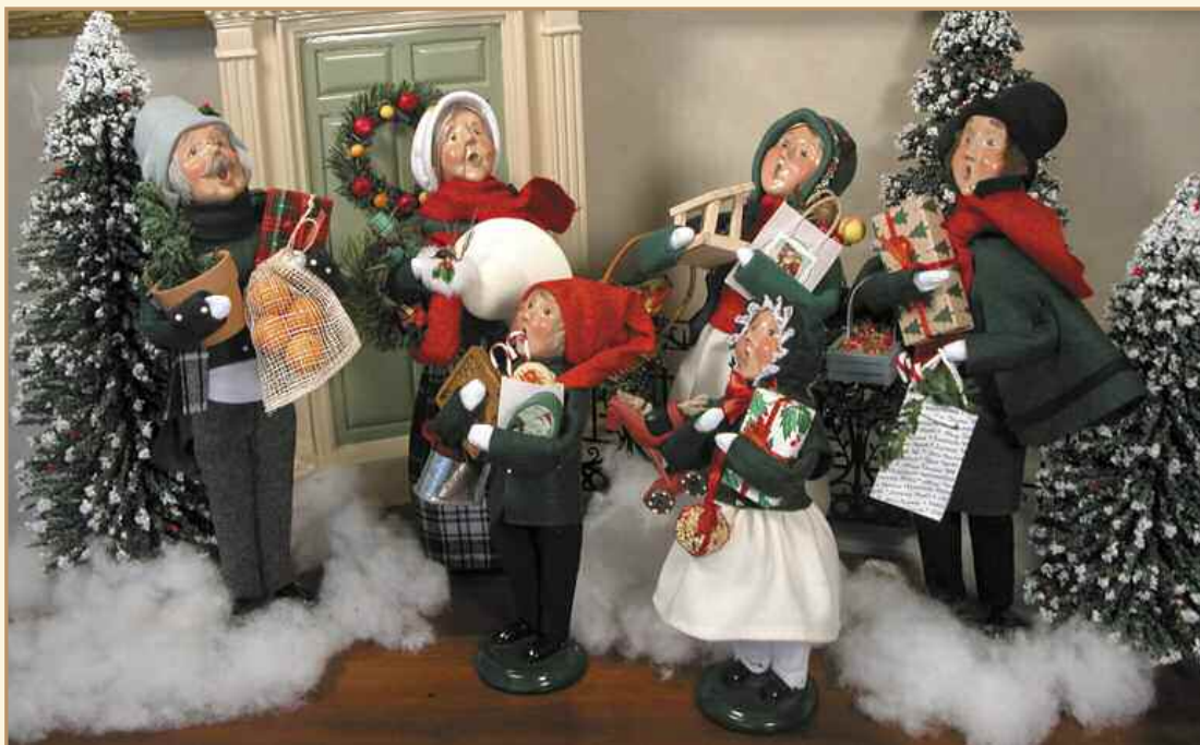
New Holiday Shoppers for 2006