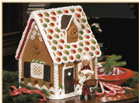
Frenchy, Bakerkin with Nonpareils Chocolate Shutter Chalet

4355 County Line Road P.O. Box 158, Chalfont, PA 18914 215-822-6700