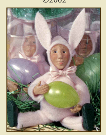
For a complete list of new pieces, visit www.byerschoice.com.