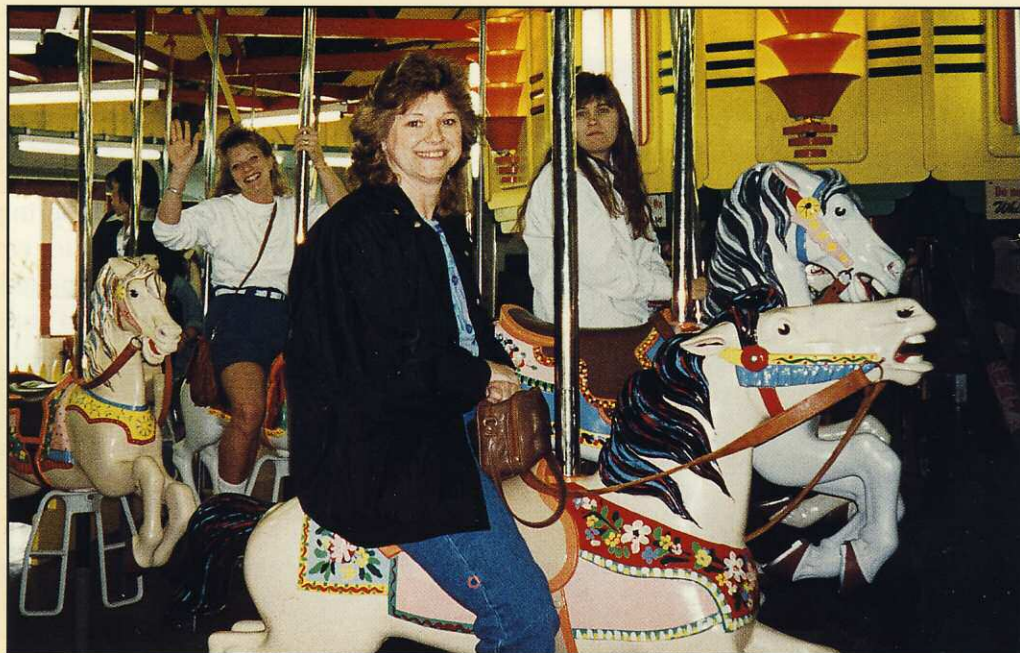
Byers' Choice Employees enjoying a carousel ride during a surprise picnic in the park