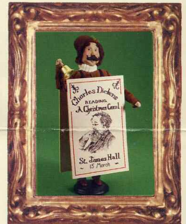
SANDWICH BOARD MAN 1994-1996