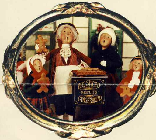
GINGERBREAD VENDOR 1996