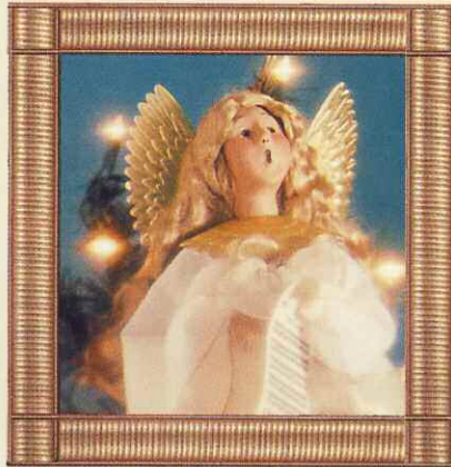
TREETOP ANGEL 1994-1996