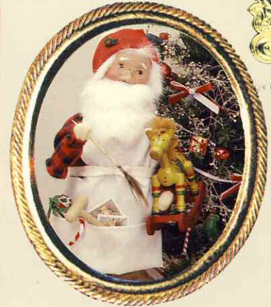
WORKING SANTA 1992-1996