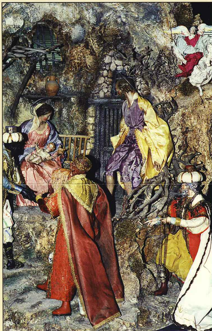
A newly made Italian presepio

himself. The international collection of nativities that they assembled over the years consists of sets from more than 40 nations.