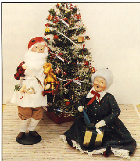
Workshop Santa and seated Mrs. Claus

P.O. Box 158, Chalfont, PA 18914 (215) 822-6700