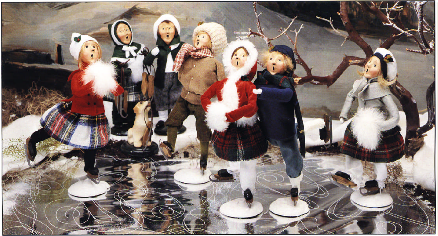
Skating kids join their parents on the ice in 1992.