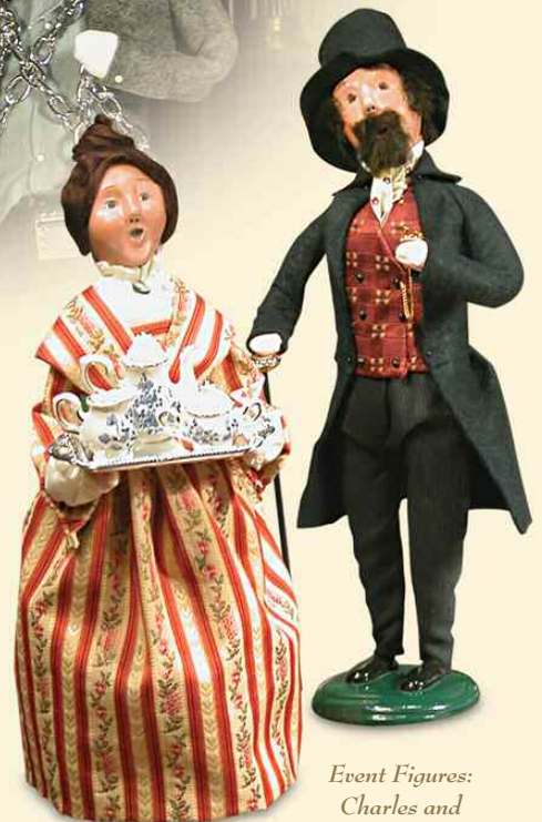
Event Figures: Charles and Catherine Dickens

For a complete update on our event happenings visit www.byerschoice.com . Some of the activities are already sold out but don't let that discourage you.